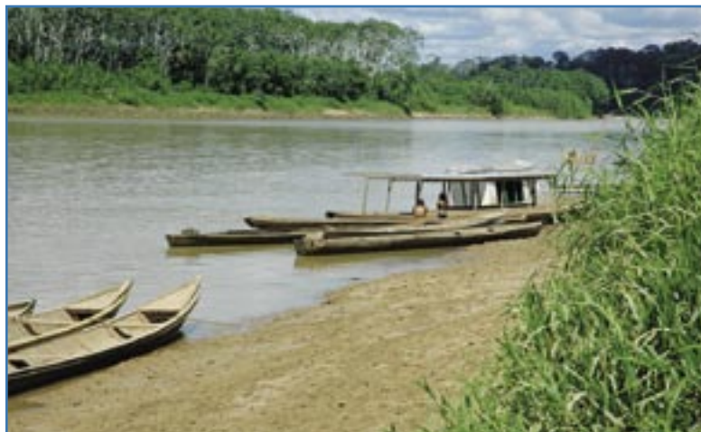
Locals take advantage of their knowledge of the Amazon basin in their work for Partners International.